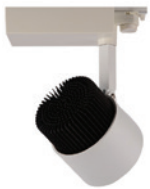
multiple Wattage Options