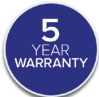
5 Year Warranty