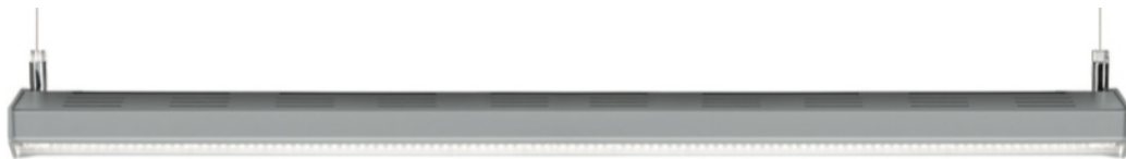
1135 x 279 x 59mm