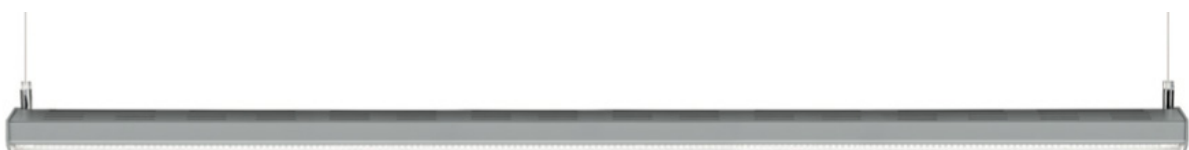
1695 x 279 x 59mm