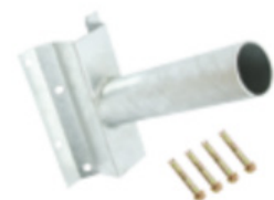
Wall bracket ø60mm