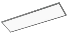
Pro 80 Flood